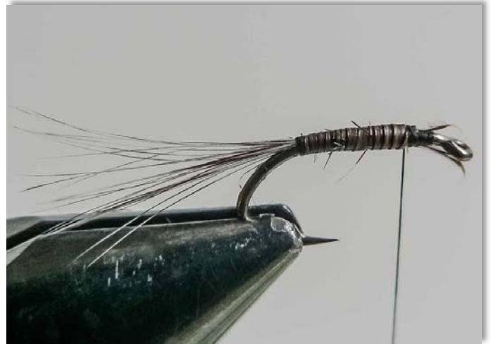
Step 2. Take a Peacock herl, (one from close to the eye) and strip the fibre from the edges of the herl with your thumb nail or a rubber. Tie in the thin end of the stripped herl at the tail end. Wind the thread forward to the front. Using hackles pliers, wind the peacock herl to the front covering the thread base and stop 2x eye widths back from the eye.