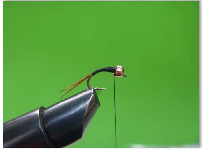
Step 2 Build up the thread to produce a good body shape.