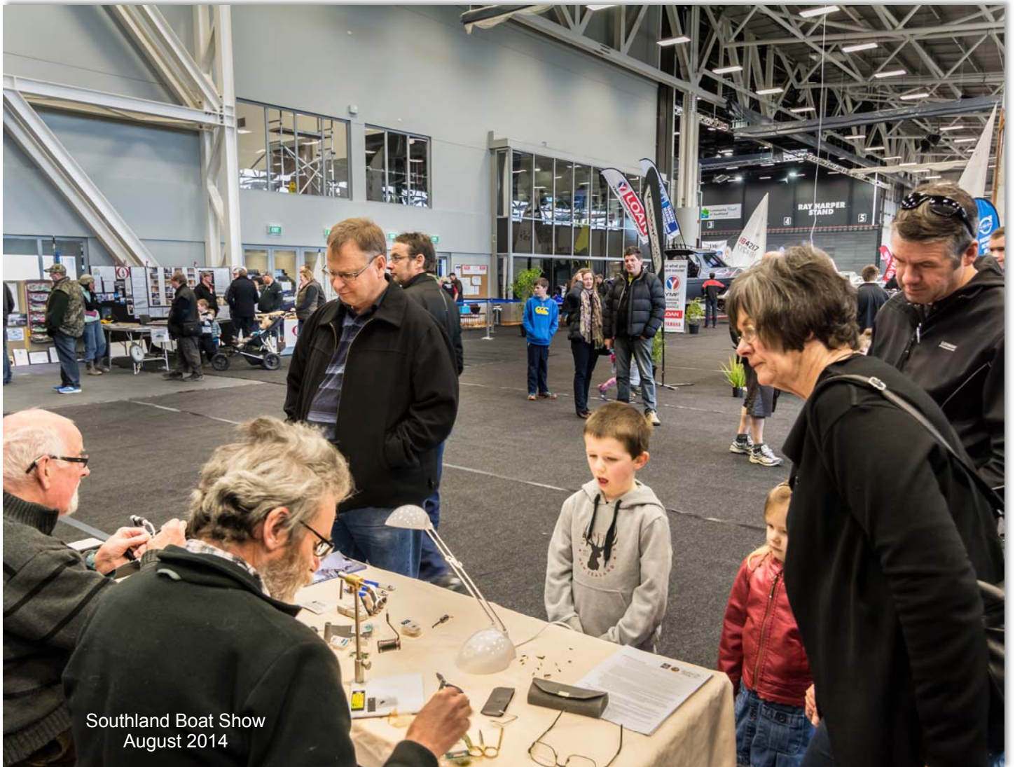
Southland Boat Show August 2014