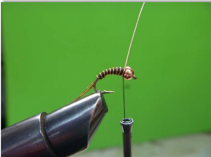
Step 3 Tie in some copper wire and wrap in a segmentation pattern up to the bead.