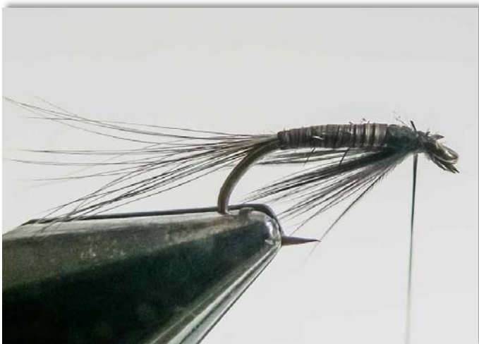
Step 3 On the under side of the hook tie in some soft hackle fibres