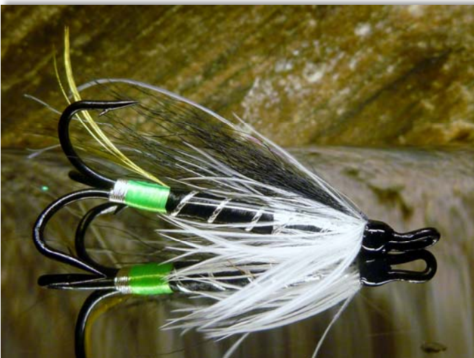
An exceptionally well tied fly and photograph