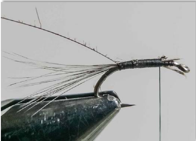
Hook size 14 Dry Fly. Thread 6/0 or 8/0 black Step 1 Lay a base of thread on the hook and tie in a tail of fibre from a grizzle feather