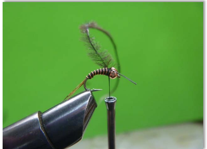
Step 4 Tie in the oyster herl and wrap on 3 or 4 turns then tie of as you will.