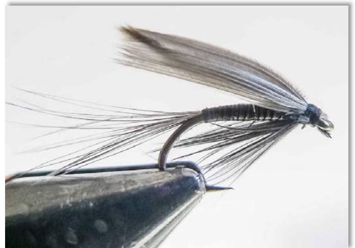
Step 4 Using slips of duck quill to create the wings tie in with them sloping backwards. Trim off, and whip finish