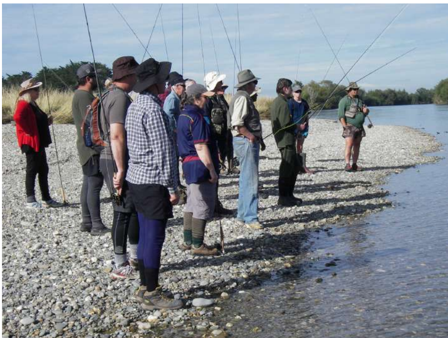
Casting & fishing demonstration at Wyndham