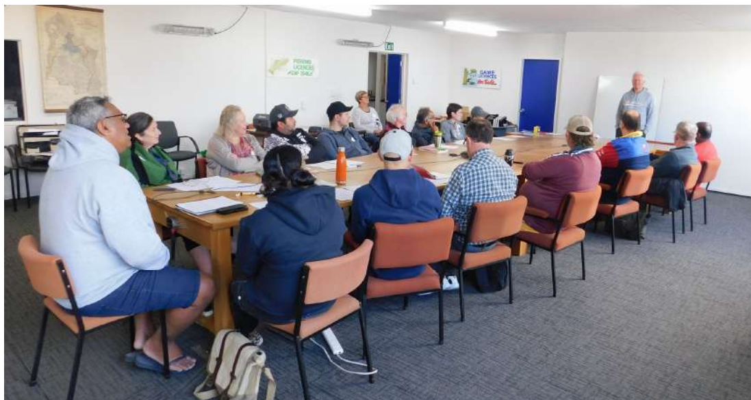
Class of 2021