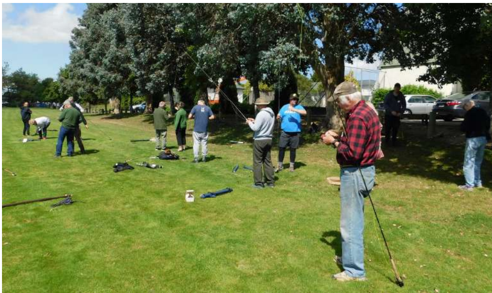
Setting up ready for casting tuition