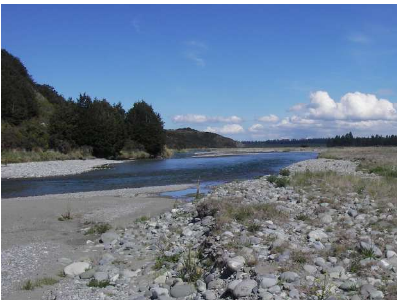
Nice day on the Upper Oreti

Prior to that I had managed a few days out. I had a day on the Upper Oreti but didn't catch any of the big browns it is famous for but at least it was fine, calm and warm and the river was in good condition. I also had a couple of trips to the Lodge. Chris was keen to get out on November 1 st for the high country opening. I went up the day before and fished a Mataura tributary in pretty wet and windy conditions. The stream was in good condition but it took me a long time to spot any fish and I pulled the pin quite early, having landed a nice