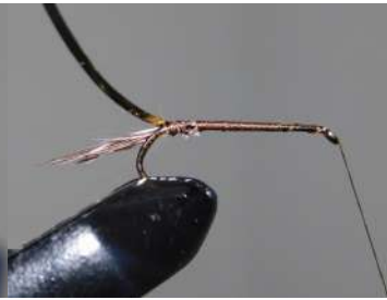
Tie in tinsel and run thread almost to the eye