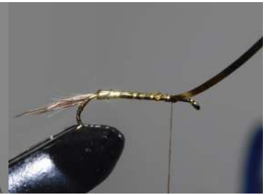
Spread some cement over binding and wind tinsel forward.