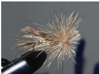
Tie in deer hair and pull tight to spin around hook. Whip finish through deer hair and trim thread.

Remove from vice and trim head and collar.