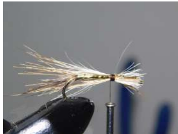
Tie in the wing fibres. Deer hair has been used here in place of squirrel.