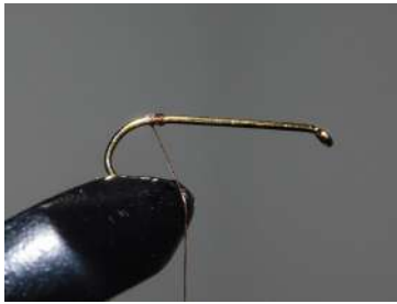
Start thread almost at the bend of the hook