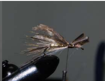
Tie in wing feather,