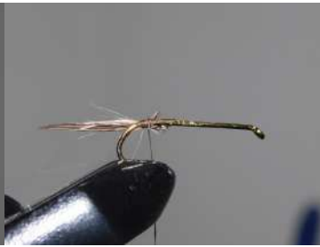
Tie in tail