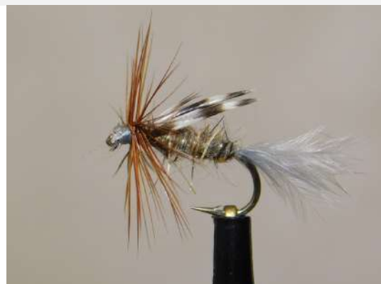
Dave's winning timberlake emerger.

You were given seven cards so it is best to use one per month for the season unless you catch a big brown and a big rainbow in the same month as only the biggest fish for the month goes in your total for the Masters Trophy.