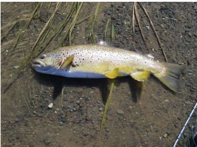
One of Dave's opening day Aparima browns.