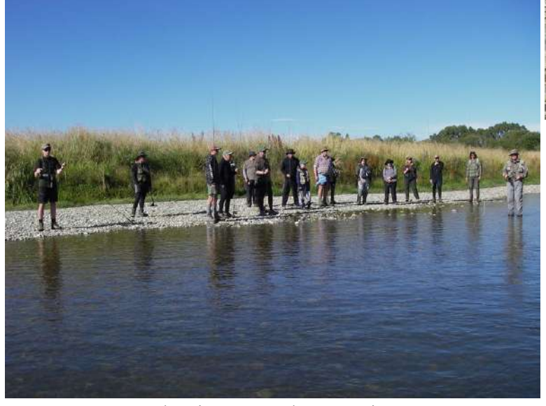
On the river - Sunday morning