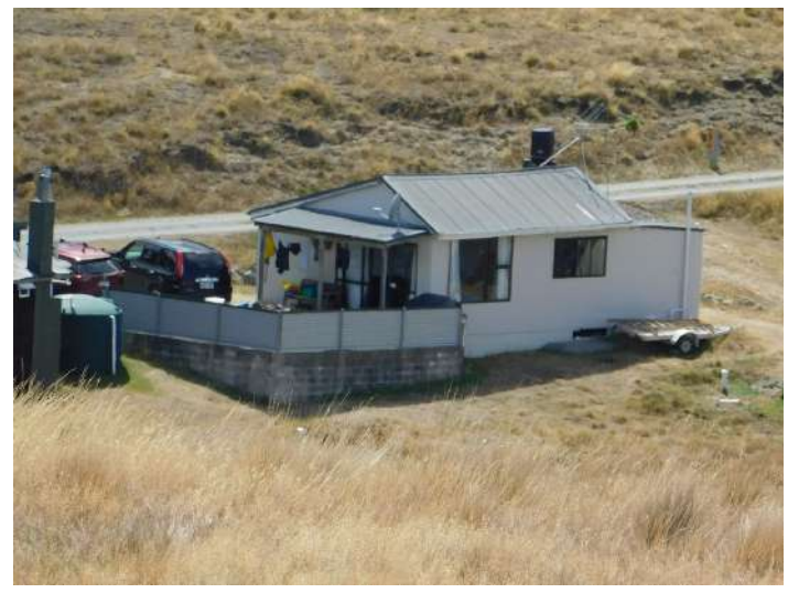
South Canterbury Anglers Club Outlet Hut at Lake Alexandrina