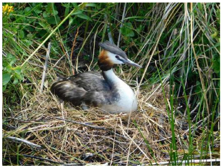
Crested Grebe at Lake Alexandrina