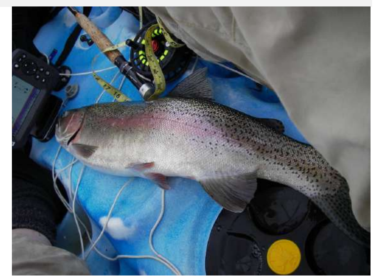
Lake Alexandrina rainbow. Not a lot of room for fish in the kayak.

We had only landed seven fish, with three into the club row boat and four into the kayak. All those coming to the kayak were released. The fish seemed to be spread otver a greater depth than previous years and this may have been why we didn't catch many. On the bright side the winds were a lot less