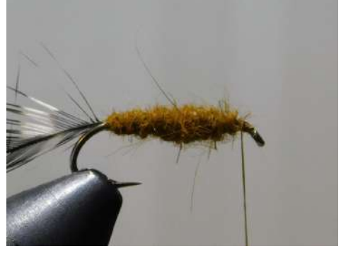
Dub the body with a bit of a taper and then taper down again towards the eye. Don't go too close to the eye.