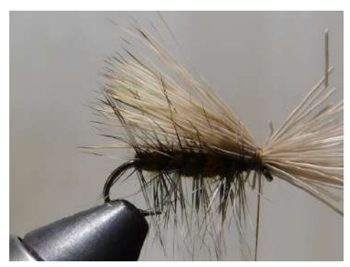
Cut some elk hair and remove all the loose material near the bottom of the hair. Stack hair in a hair stacker then tie in. Length should be just out beyond the dubbing.