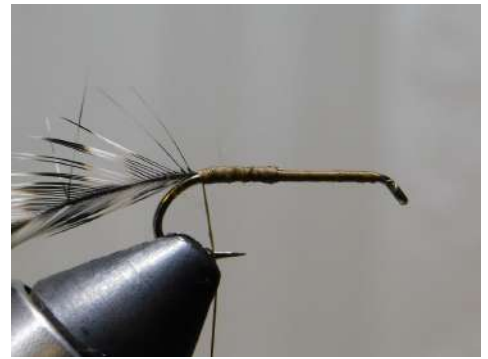
Tie in the hackle at the bend in the hook facing away from the eye.