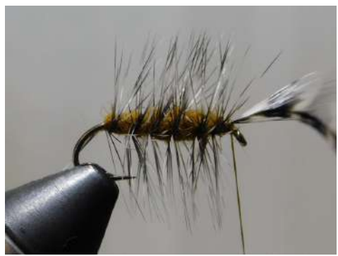
Wind the hackle forward with about six turns and tie off. Then trim the hackle.