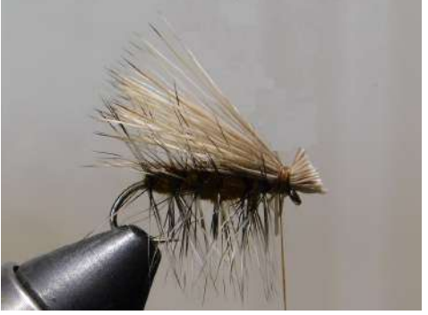
Whip finish and trim the elk hair to form a head. If there are any stray bits of hair trim them off and put a dab of cement on the whip finish.