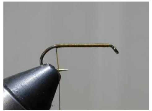
Put hook in vice and run thread down to the bend in the hook.