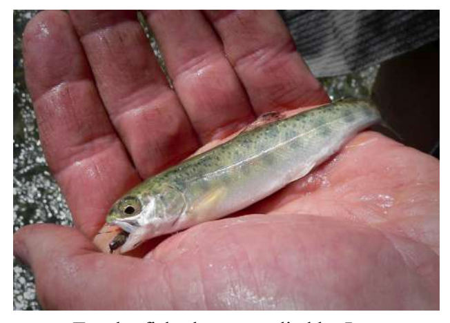
Trophy fish

Les was a member of the Club and a keen fly fisher before shoulder damage made it difficult to cast a fly. When you were heading on a fishing trip with Les you had to be prepared to stop immediately if Les spotted something that looked worthy of photographing. He would take many photos going to and from fishing trips as well as on the river and normally carried a digital SLR camera when fishing.