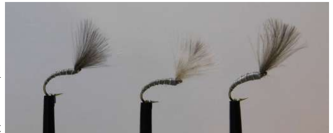
Winning flies from August