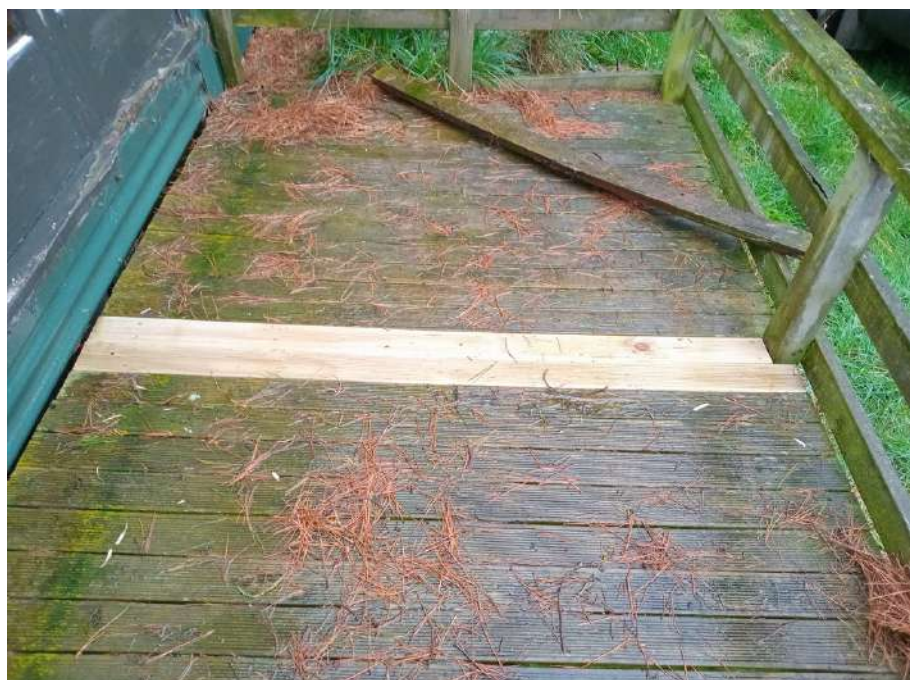
The repaired deck