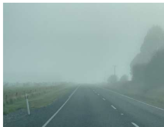
Road conditions and Queenstown snow.

Again Southland women, i.e. Gerda and myself kicked off the day at 11am by our NZ posts. The International Womens Fly Fishing Day site is well worth a visit to see the awesome fish and rivers around the globe. As coined by social media this is the 'World's biggest Fly Fishing day out.'