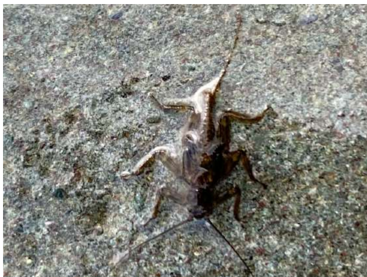
Stonefly nymph on the Whitestone River