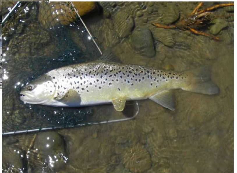
A nice Aparima brown

The Von River taken on the November Lodge Trip. While the river looks small the rainbows spawn above here.