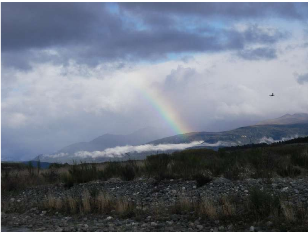
Weather looking a bit threatening on the Upukero-ra on the Sunday of the April Lodge Trip.