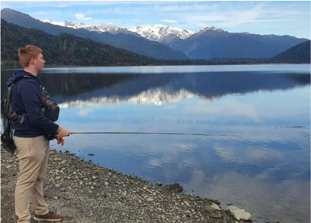
Winner - General