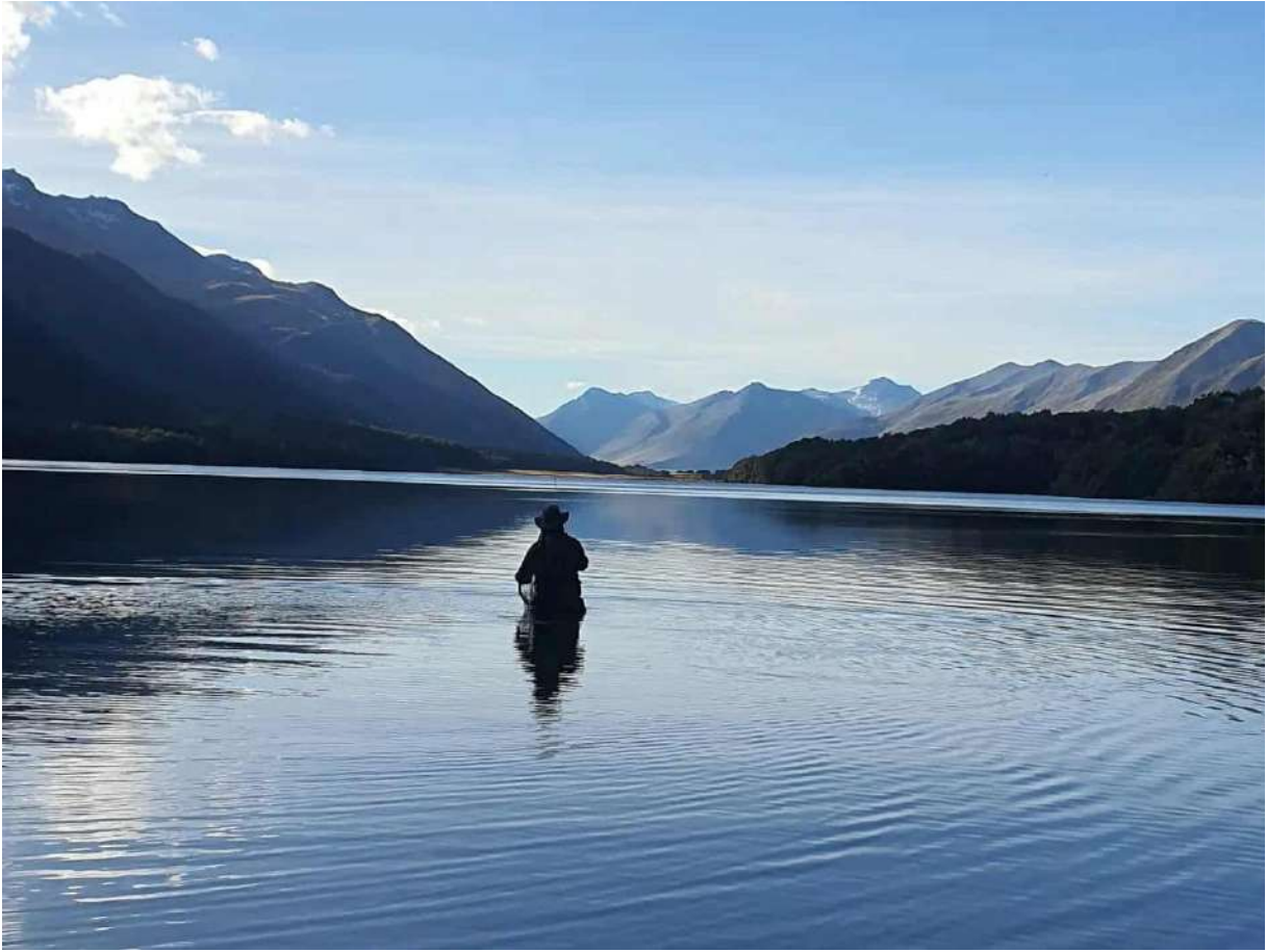
Winner - Scenic

We held our annual photo competition at the June Club Night. Unfortunately not many entries this year but still some good photos.