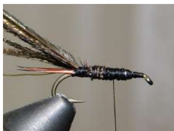
Tie in four peacock herl at the tail