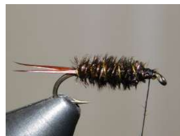
Wind the gold wire forward in the opposite direction to the peacock herl. Tie off and trim