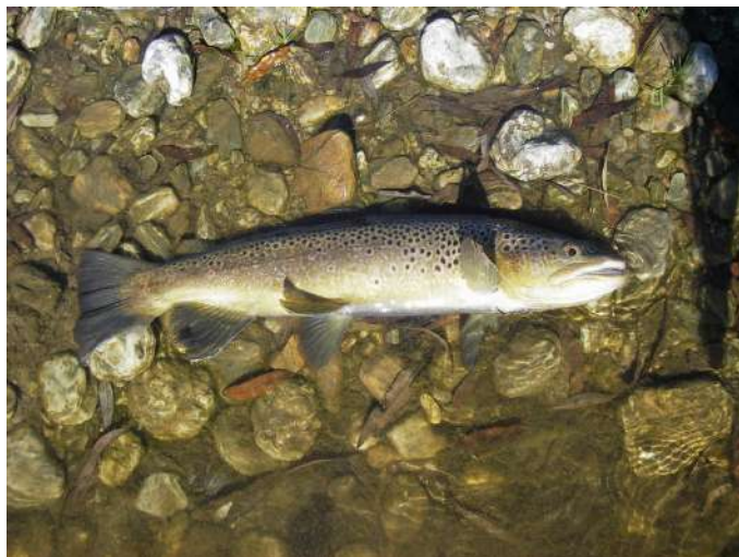
Waikaia brown caught on the April mid-week trip.

At the end of the day there were some sheep on the other side of the river and somehow in their rush three had dropped down a steep bank and they were just above the water level. For some reason they decided the only way out was to jump into the river and swim. They had no problem swimming across the deep water at the bottom of the bank and were soon back on dry land.