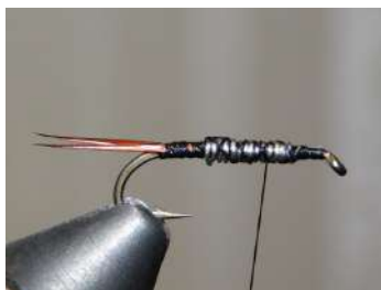
Wind lead or lead free wire on hook