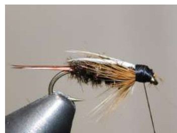
Trim biots and cover ends with thread. Finally whip finish and coat head with head cement.