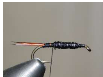
Run thread over wire. It doesn't need to cover it completely.