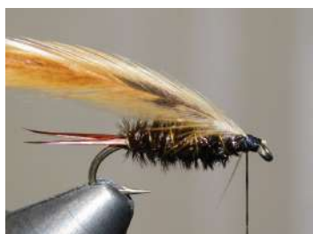
Tie in hen hackle