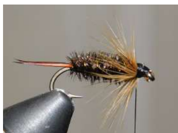
Wind hen hackle around three times and tie off. Run thread back around to force the hackle fibres back