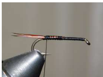
Tie in two brown goose biots to form tail. They should curve out and be about 2/3 length of body