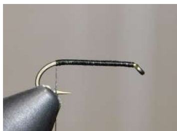
Put hook in vice and run the thread to the bend of the hook