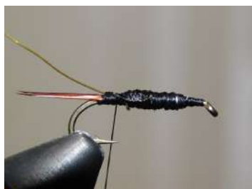
Tie in gold wire at the tail