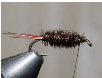
Wind the peacock herl forward to form body. Tie off and trim.