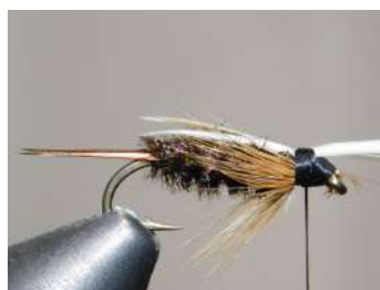
Tie in two white goose biots on top of head. They will tie in better if you cross them at the tie in